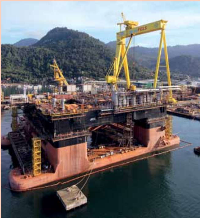
5. BrasFELS installed and integrated the lower hull with upper hull structures