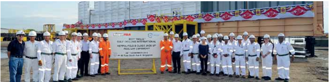
The project teams of Keppel and GDI celebrating the keel laying of the Halul, the fifth KFELS B Class jackup rig Keppel is building for GDI

over the multiple projects and continually improved efficiencies on the construction process. Halul is scheduled for delivery in 1Q 2016.