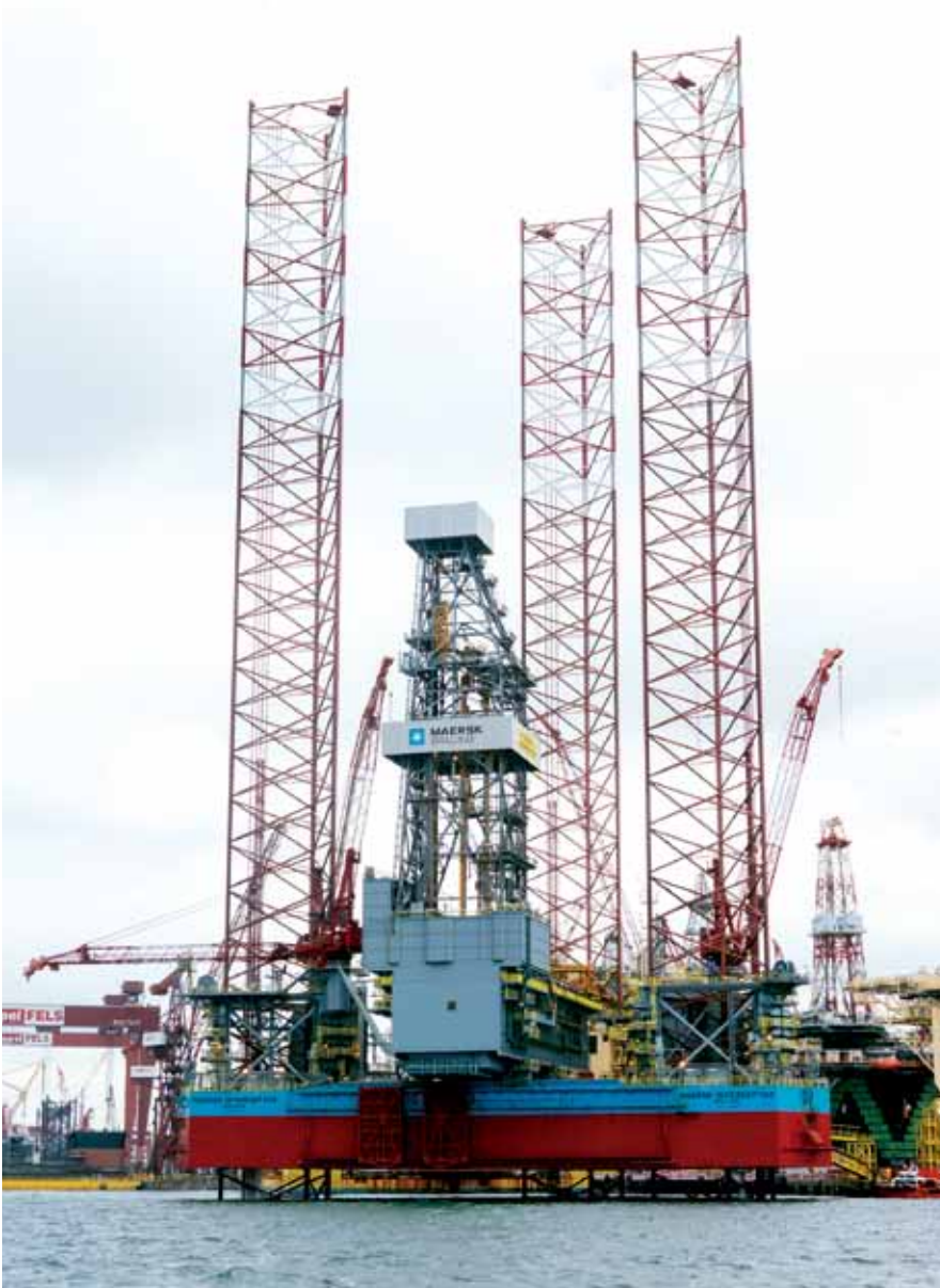
Keppel FELS delivered one of the world's largest jackup rig, XLE-2, to Maersk Drilling on budget and seven days ahead of schedule. It is the second of three XLE rigs that Keppel is building for Maersk

Armada Cabaca Limited while Keppel Nantong's contract is to construct a submersible barge, Giant 7, for Smit Shipping.