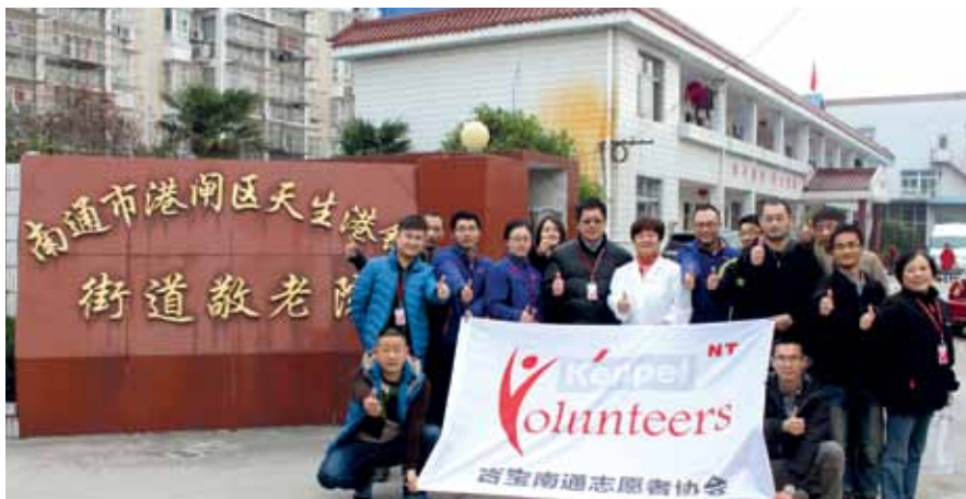
Volunteers from Keppel Nantong brought warmth and cheer to the elderly at a local nursing home

To cap off a productive morning, the volunteers split into groups to help with gardening and light chores around the nursing home.