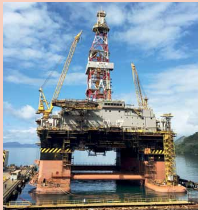
8. Commissioning of marine systems and load testing of engines underway