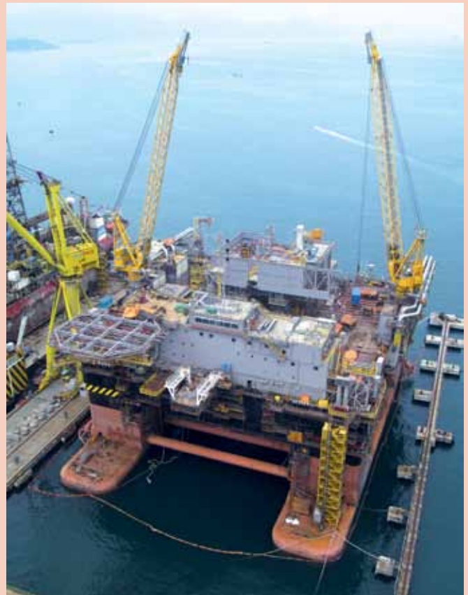
6. Installation of topside components at BrasFELS