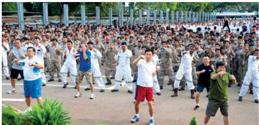
Keppelites worked up a good sweat with a vigorous kickboxing workout at the annual KFELS Active Day held at Pioneer Yard

our health but it also increases our concentration at work, enabling us to work safer and more productively," he said.