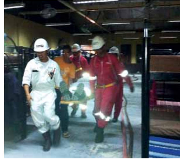
A fire drill was conducted at Keppel Batangas Shipyard to strengthen emergency preparedness

As the exercise was a joint effort by a number of departments such as Security and HSE (Health Safety & Environment) and external agencies such as the Philippines Navy, it also helped to foster and further strengthen inter-agency and inter-departmental collaboration and support.