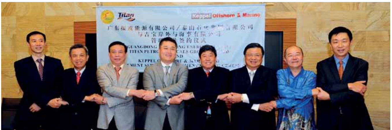
Keppel O&M is establishing a win-win partnership that will enable Keppel and Titan to become a major offshore solutions provider for China