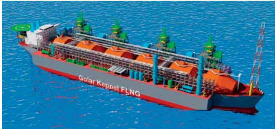
Keppel Shipyard's contract with Golar Hilli Corporation to perform the world's first-of-its-type conversion of an existing Moss LNG carrier, the HILLI, into a Floating Liquefaction Vessel became effective in July 2014

the third ultra-premium harsh environment ENSCO 120 Series jackup rig, to EnSCO ahead of schedule.