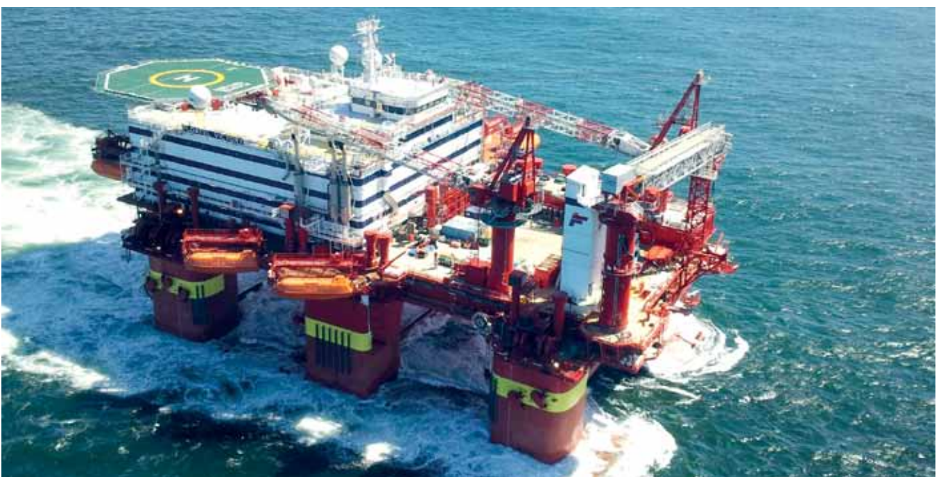
Completed in 2010, the Floatel Superior is the first DSS™ 20NS accommodation semi built for the North Sea, where it has been operating successfully

In recognition of its innovative, world-class features, the DSS™ 20NS design bagged a Gold award at the Keppel O&M Innovation Awards 2014. In 2013, the design also received external recognition, garnering the Prestigious Engineering Achievement Award from the Institution of Engineers Singapore in 2013.