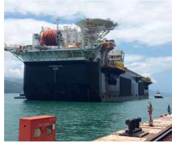
BrasFELS' workscope for P-66 includes the fabrication, installation and integration of topside modules

BrasFELS has been engaged to perform a similar work scope for FPSO P-69. When completed, P-66 and P-69 will be deployed in Brazil's Guara field and Tupi field respectively.