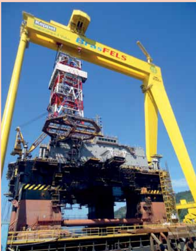
7. BrasFELS installed the derrick with the 2,000-tonne crane, which is the tallest gantry crane in Latin America