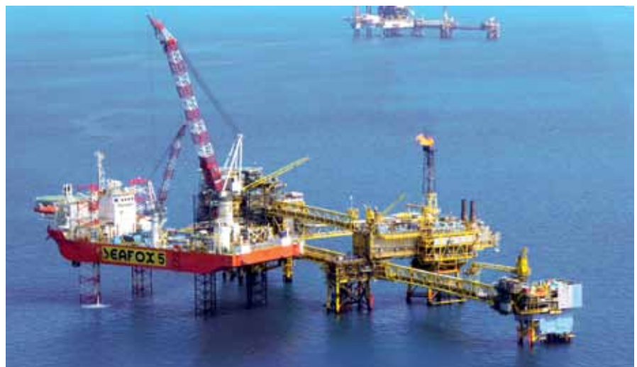
The versatility of Seafox 5 which is based on Keppel FELS’ Multi-Purpose Self-Elevating Platform design enabled it to work for Maersk Oil in the Tyra field off Denmark