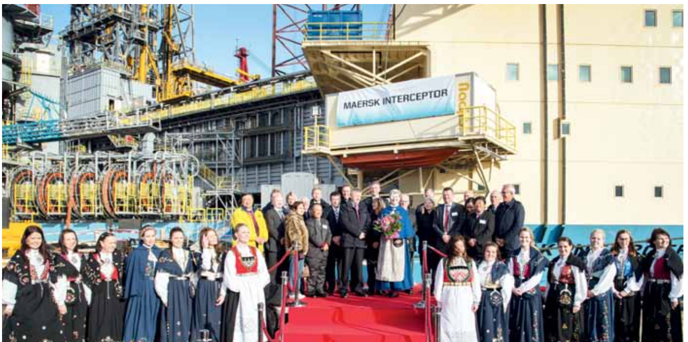
Keppel Offshore & Marine management celebrating the naming of Maersk Interceptor with Maersk Drilling and Det Norske at a traditional Norwegian ceremony in Stavanger, Norway