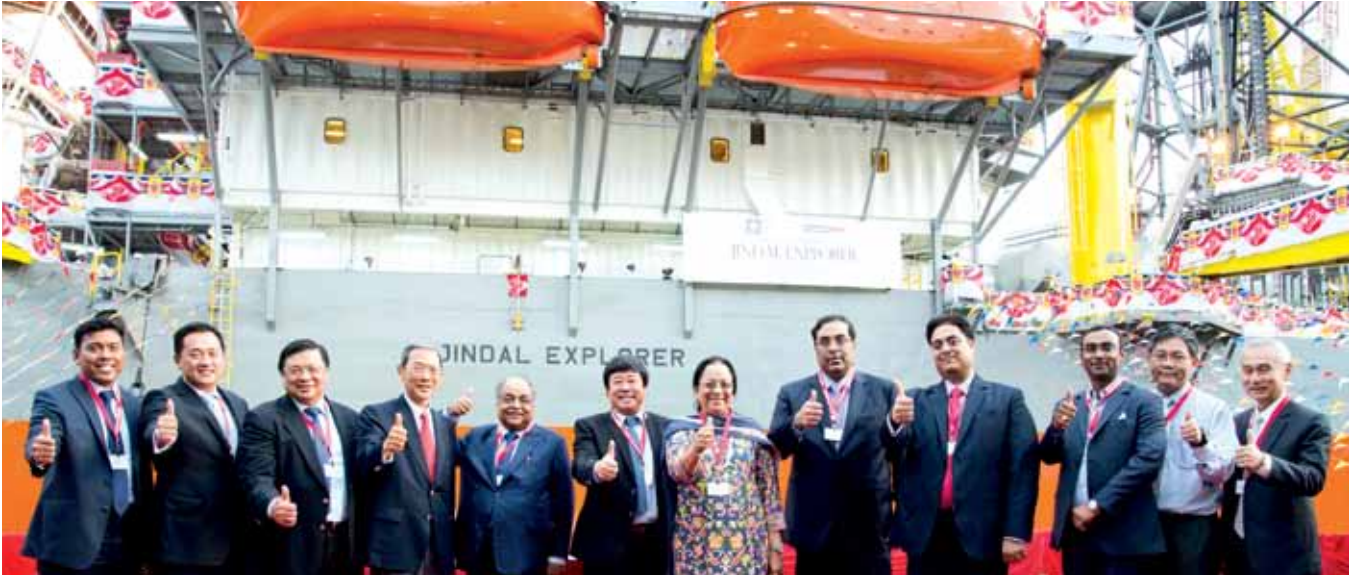
The management of Keppel O&M and Jindal celebrate the successful delivery of the Jindal Explorer, the third jackup rig Keppel O&M has delivered for Jindal

Keppel FELS has delivered a third KFELS B Class jackup drilling rig to Star Drilling Pte. Ltd., an associate company of India's D P Jindal Group (Jindal).