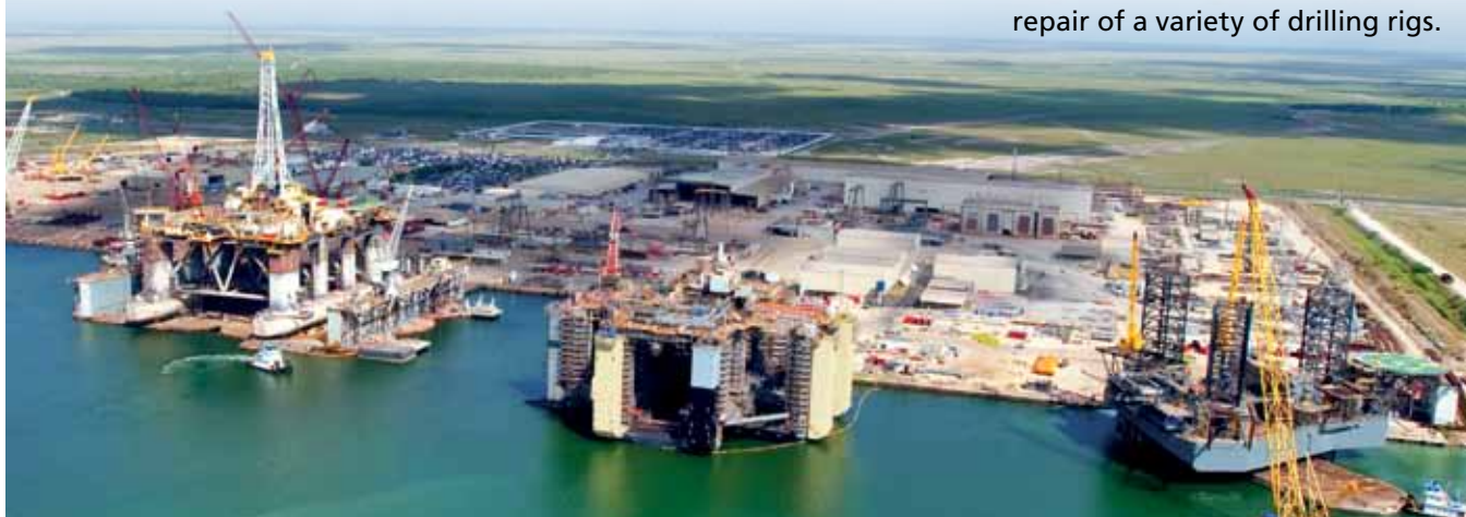
Keppel AmFELS, located in Brownsville, Texas, US, is one of the most established yards to serve the Gulf of Mexico

Backed by comprehensive facilities and a highly-capable workforce, Keppel AmFELS has built up a strong track record in the construction, refurbishment, conversion, life extension and repair of a variety of drilling rigs.