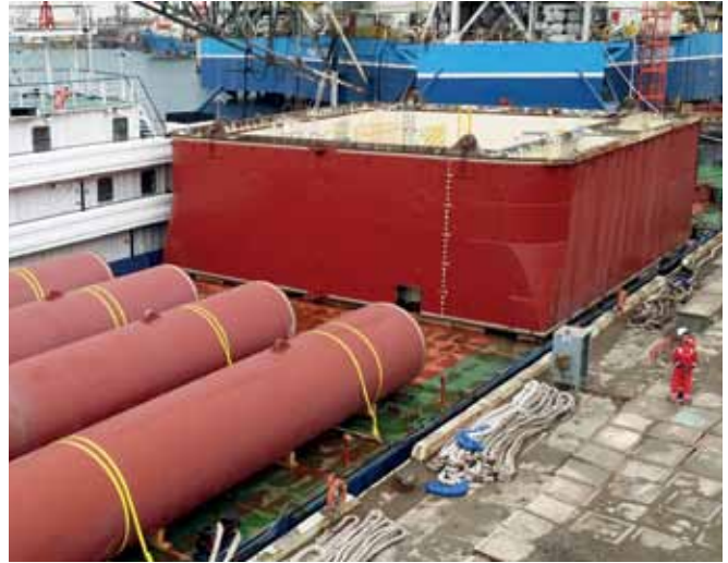
Earlier, in October 2014, four columns and bracings of the rig arrived in Baku