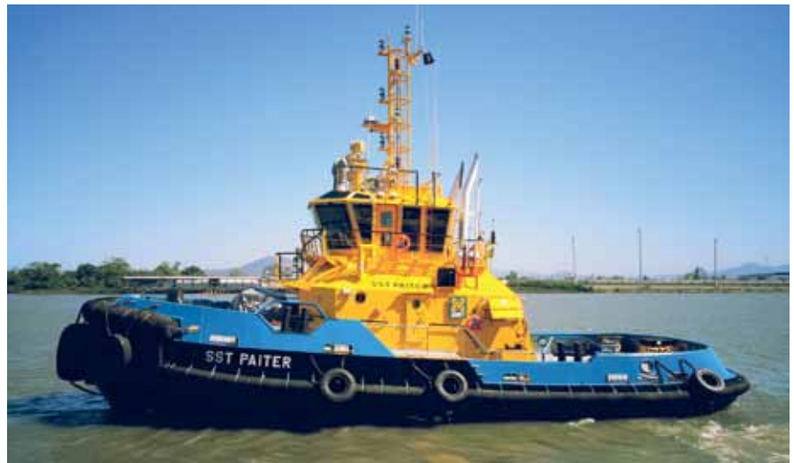
SST Paiter is the fifth harbour tugboat that Keppel Singmarine Brasil has delivered to SMIT Rebras