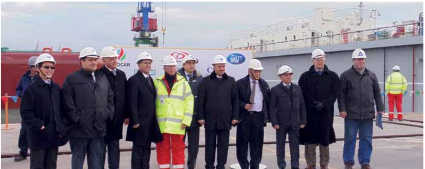
Celebrating the pontoon launching are the management from CDC, SOCAR, ABS, CSC and Baku Shipyard

In building the most advanced and high specification semisubmersible (semi) drilling rig in the Caspian region, Keppel is leveraging its two yards in Azerbaijan, Caspian Shipyard Company (CSC) and Baku Shipyard, as well as the engineering expertise of Keppel FELS in Singapore.