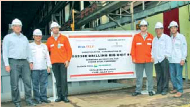
1. BrasFELS, in Angra dos Reis, Rio de Janeiro, Brazil, struck steel for Urca on 13 July 2012

Project milestones for Urca, the first of six DSS™ 38E semisubmersible drilling rigs that Keppel O&M is building for Sete Brasil.