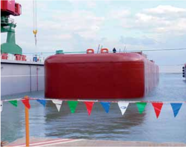
Baku Shipyard launched the port pontoon on 2 December 2014