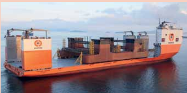
3. Lower hull arrived in Brazil from Singapore in January 2014