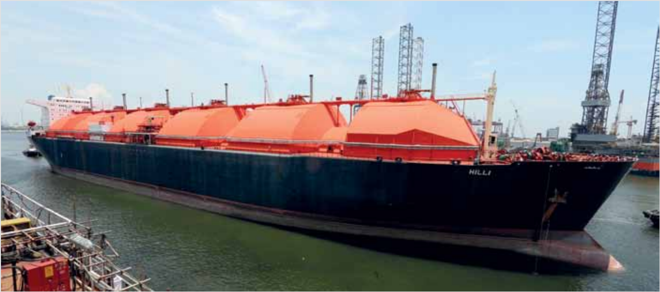
Keppel Shipyard is currently performing the conversion of LNG carrier, the HILLI, into an FLNGV, which is expected to be completed in early 2017. The LNG carrier, the HILLI, sailed into Keppel Shipyard for the commencement of conversion works in September 2014

Six months after it secured the world's first-of-its-type floating liquefaction vessel (FLNGV) conversion contract from Golar LNG Limited (Golar LNG), Keppel Shipyard has secured a second firm contract from a subsidiary of Golar LNG to perform the conversion of a second Moss Liquefied Natural Gas (LNG) carrier, the GIMI, into an FLNGV.