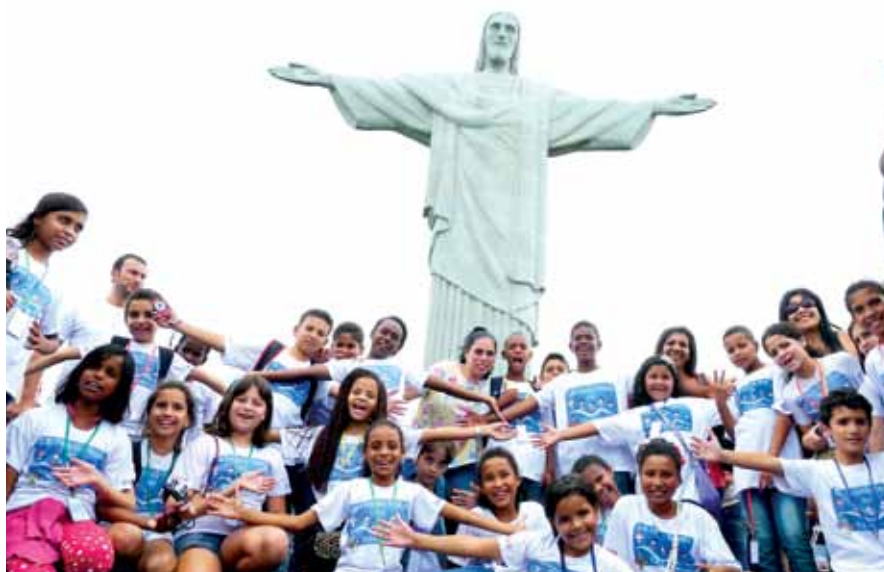
BrasFELS sponsored an educational day trip for the students of Cornélis Verolme, a school in Angra dos Reis, in the state of Rio de Janeiro, Brazil on 26 November 2014

Most students on the trip were part of the Brazilian Ministry of Education's Mais Educação (More Education) programme, which promotes holistic education.