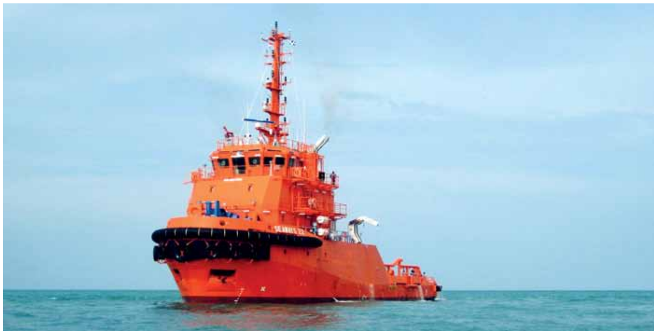
Keppel Singmarine has been contracted to build the fifth Anchor Handling Tug (AHT) vessel for Seaways International. Seaways 22 (above) was the fourth AHT unit that Keppel Singmarine delivered to Seaways in 2013.

Keppel Singmarine has secured contracts for a newbuild vessel and to provide technical services for a liftboat.