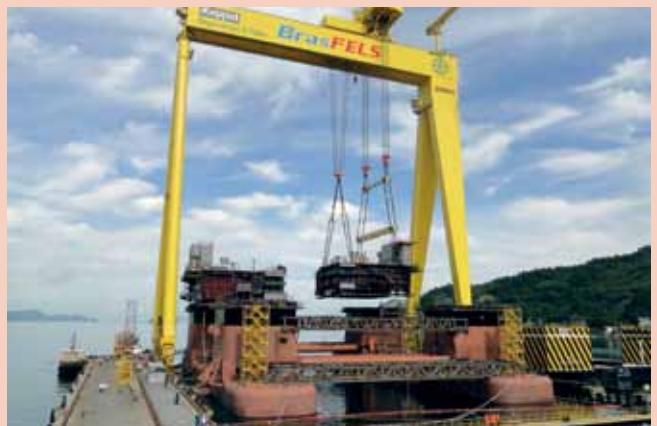
4. The lifting of the modules for Urca. The heaviest lifting weight undertaken was 1,933 tonnes (block weight plus rigging weight)