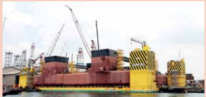
2. Integration of pontoons and columns at Keppel FELS, Singapore